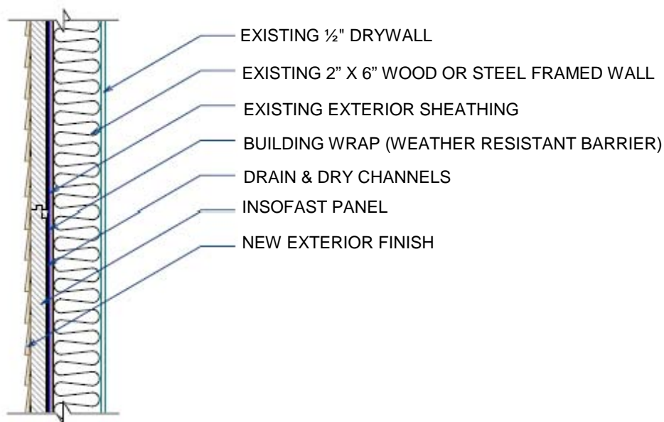
FIGURE 3 – Typical Exterior Installation