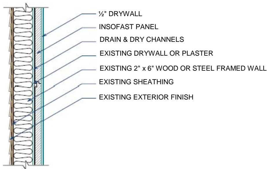
FIGURE 2 – Typical Interior Installation